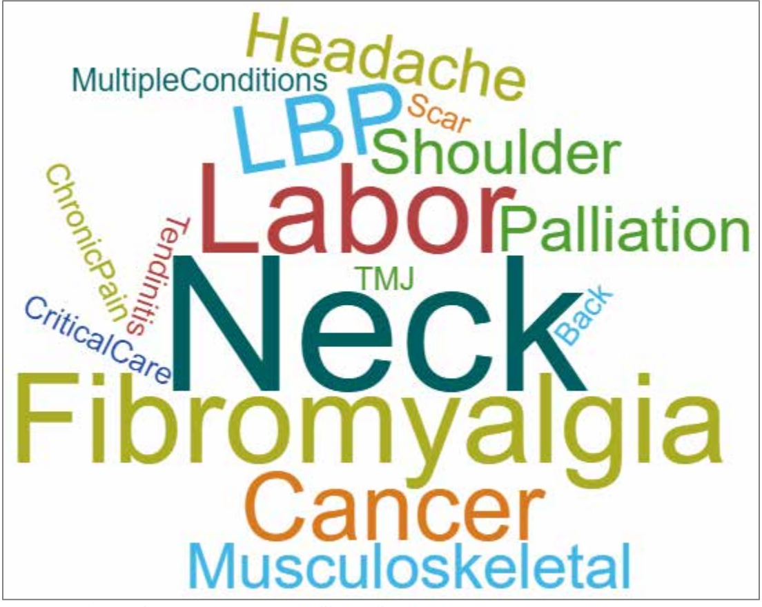
Figure 3. Types of Pain in Included Systematic Reviews

LBP = low back pain; TMJ = temporomandibular disorder