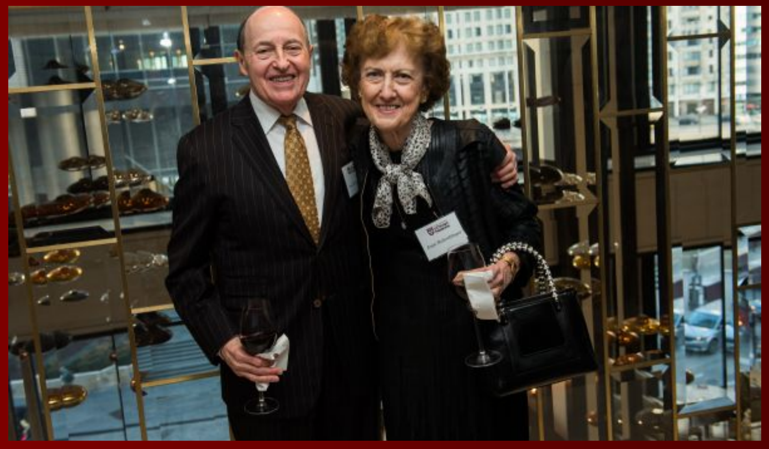
A Success Story