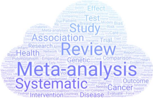
Word cloud from publication titles