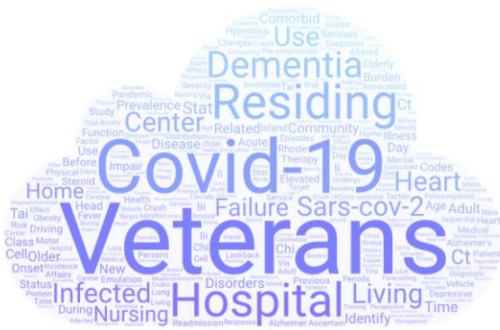
Word cloud from publication titles