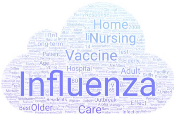
Word cloud from publication titles