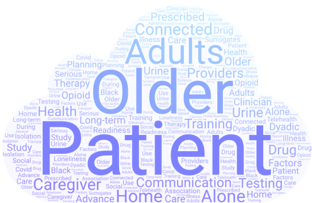
Word cloud from publication titles