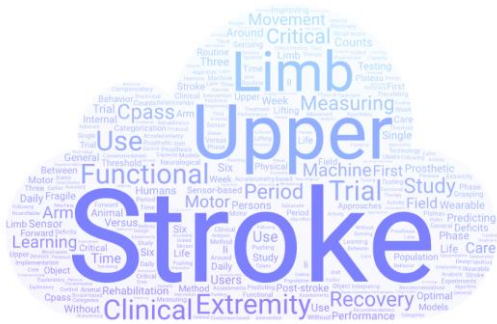
Word cloud from publication titles